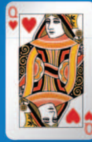
Mixed Pair (A)